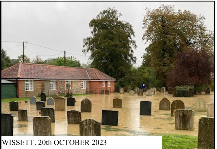
FLOODED CHURCH AND CHURCHYARD, WISSETT. 20th OCTOBER 2023