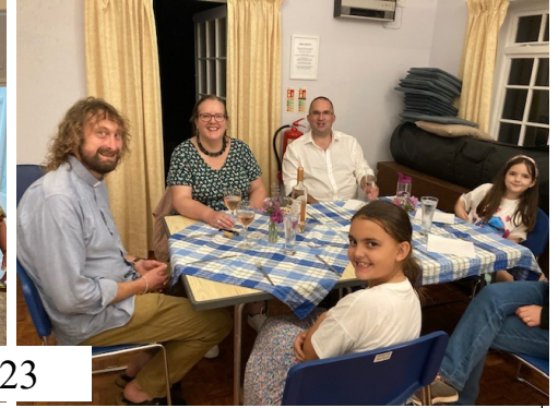
WISSETT HARVEST SUPPER 2023

A happy evening was had by all at the Harvest Supper!