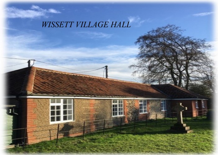
WISSETT VILLAGE HALL

Please join us to hear about future plans and to elect your trustees for the coming year.